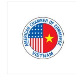
Vietnam (Ho Chi Minh City)